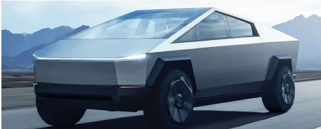
CYBERTRUCK (from Web info)

https://hypebeast.com/jp/2022/7/cybertruck-delivery-mid-2023-date-news-info