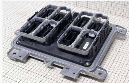
Overview of Integrated ECU (Right)

https://hypebeast.com/jp/2022/7/cybertruck-delivery-mid-2023-date-news-info